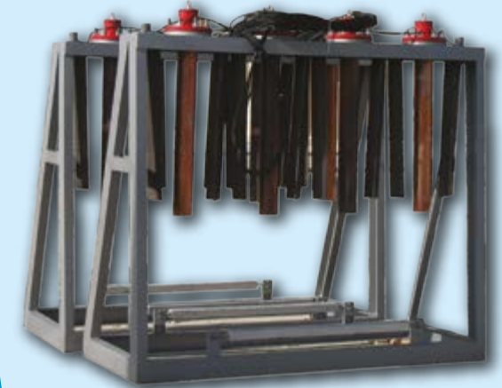
Conventional grid Anti Fouling System